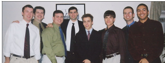
We ended the semester with a Christmas banquet. Here I am with the guy small group leaders.

It's after conversations like these that I realize how much of a family Chi Alpha is to these students and others. Everyone wants to be accepted. If they can't find the love they need at home then they'll look elsewhere. Some search for love in immoral relationships, some look for happiness in drugs or alcohol, some try to fit in by joining an endless string of parties night after night. But nothing else satisfies like Jesus. It's the ones who meet Him and become part of the family of God who know what real, unconditional love is.